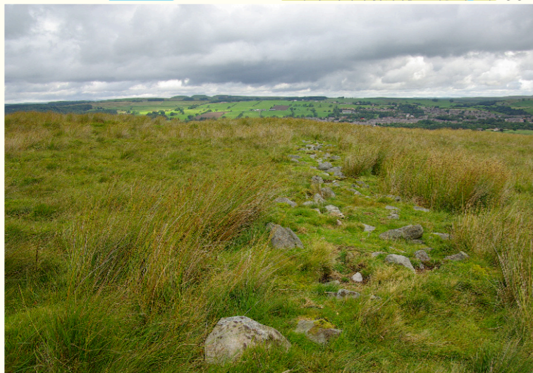
The line of stones that you see today is all that remains of a farm over 2000 years old.