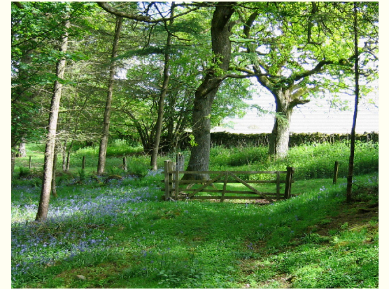
This circular walk takes you over Broomhouse Common with wide views over the Tyne Valley and towards Hadrian's Wall.

The thick trunks and tangle of branches from the pollarded oaks (pictured above by the wall) near Broomhouse show how this timber was harvested in the past by cutting branches rather than felling the whole tree.