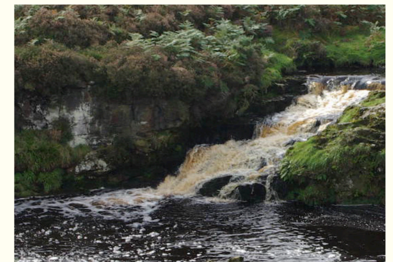
Lynnshield's waterfall on the Park Burn.

The thick trunks and tangle of branches from the pollarded oaks (pictured above by the wall) near Broomhouse show how this timber was harvested in the past by cutting branches rather than felling the whole tree.