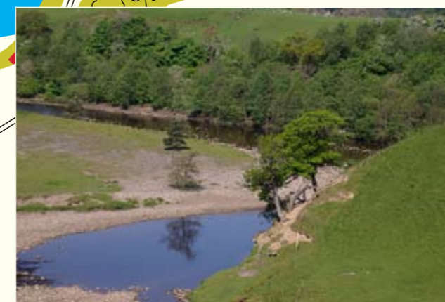
Metals from mining upstream have collected on this bend in the river so the soil here supports rare metal-loving plants like the Tyne Hellebore, Alpine Penny Cress and Spring Sandwort.

This 6 mile walk takes you through woods and across farmland in a loop around one of the most scenic areas of the South Tyne.