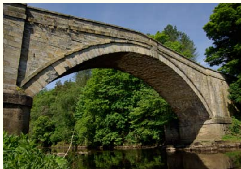
Featherstone Bridge arching over the South Tyne.